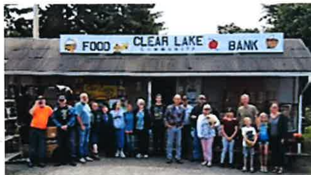
We LOVE you, Clearlake Volunteers!